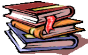
The Recommended Study Time Program

If the student is absent on the scheduled RST date they will be expected to attend on the make-up date. The school will not remind them.